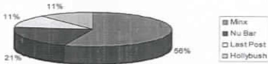
Percentage of Crime along Loughton High Road linked to Pubs and Clubs